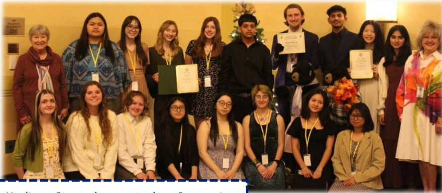
Madison Co. Anchors - Anchor Convention