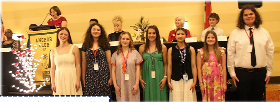
Incoming Anchor Board (2026-27)