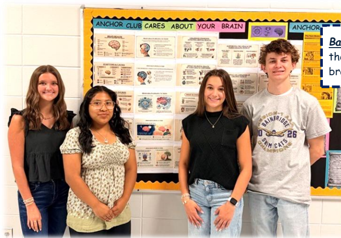
Bainbridge HS Anchor officers show off their brain health bulletin board during brain health awareness month.

To work together in friendship and loyalty; to render service to our home, school and community, knowing this course will take us over a sea of happiness; to steer our ship of life by the bright stars of Hope and Faith; to follow words of guidance from parents, teachers, and Pilot friends, for those, as gleams from the Lighthouse of Truth, are of wisdom, to set full sail through channels of achievement which lead us to the port of success; and, when our ship of life is tossed by the tempests of misunderstanding and the angry winds of injustice we will cast our Anchor of courage, wisdom, and trust to hold us fast.