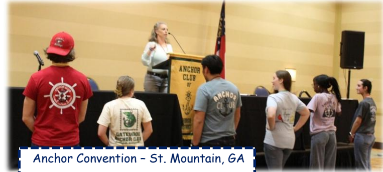
Anchor Convention - St. Mountain, GA