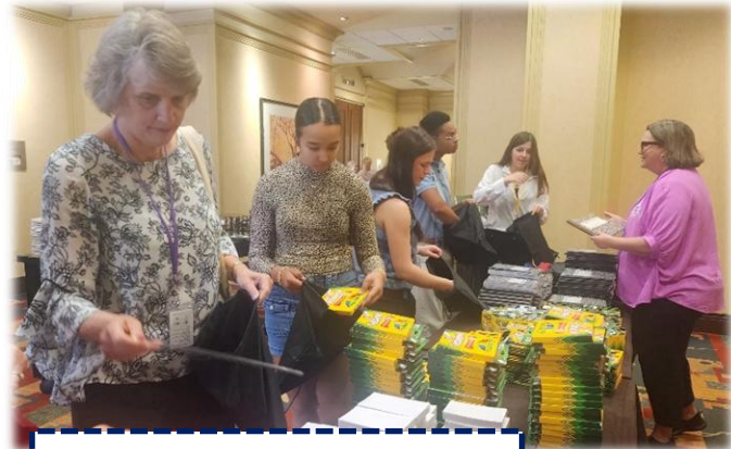
Anchor Convention Service Project