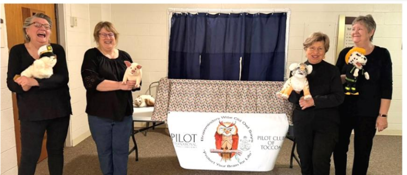
The Pilot Club of Toccoa enjoyed sharing the "BrainMinder Puppets" at First Baptist Toccoa Pre-K this morning. The children were alert and able to answer questions at the end of the program from the scripts presented. "Play Smart. Play Safe." Was the theme learned as you protect your brain!