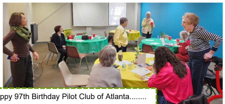
Happy 97th Birthday Pilot Club of Atlanta.....