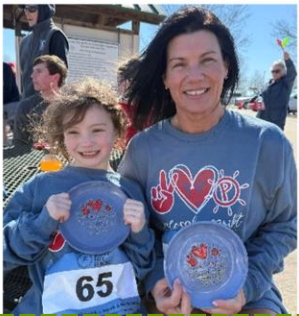
The Pilot Club of Oconee County held their 17 th annual Pilot 5K on February 7. It was a beautiful day to enjoy this fundraiser that funds many of our projects!