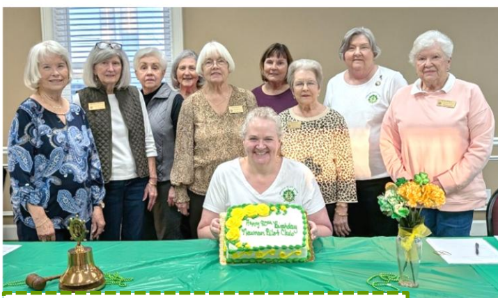
The Newnan Pilot Club celebrated our 80th birthday Tuesday evening! We were chartered on March 6, 1946, in Newnan, Georgia. For the past 80 years we have worked diligently for the people of Newnan and Coweta County