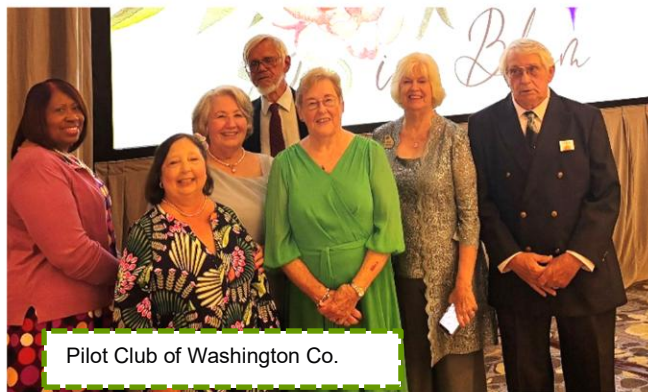
Pilot Club of Washington Co.