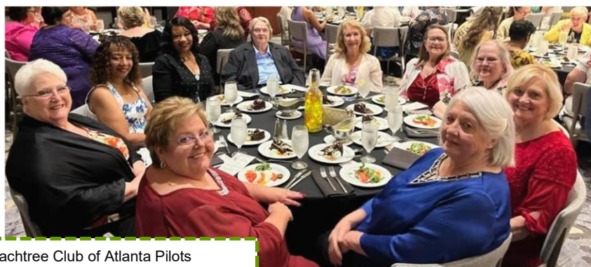
Peachtree Club of Atlanta Pilots