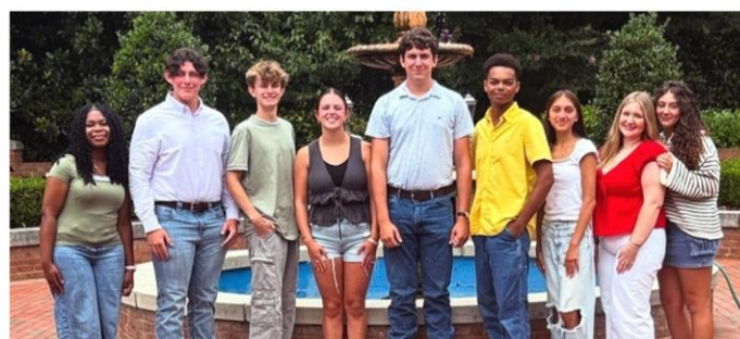
GA District 2025-2026 Anchor Board met at PI Headquarters to start planning Anchor Convention!!