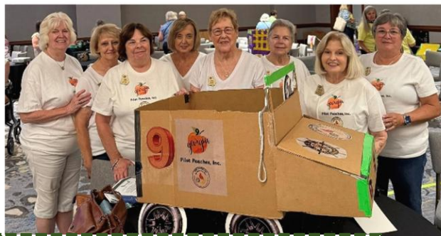
Georgia District won 'Most Creative' race car at Council of Leaders