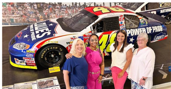
Pilot Club of Hartwell Pilots at the NASCAR Hall of Fame in Charlotte