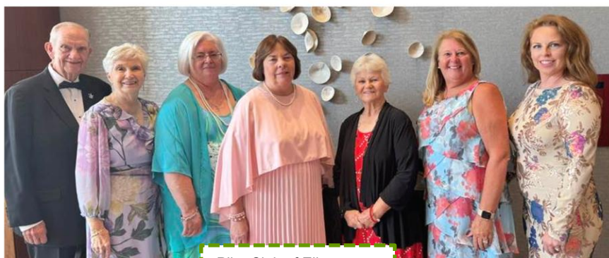
Pilot Club of Elberton