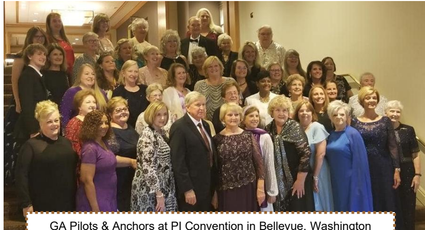
GA Pilots & Anchors at PI Convention in Bellevue, Washington