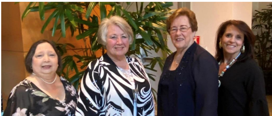
Pilot Club of Washington County Pilots at the PI Convention Installation Banquet