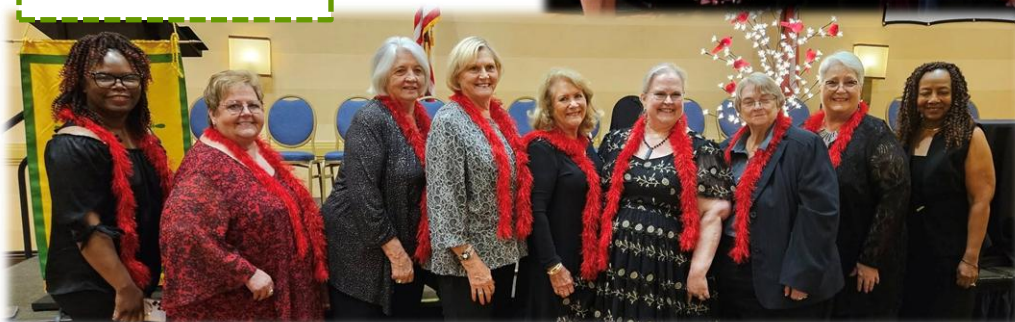
Pilot Club of Brunswick