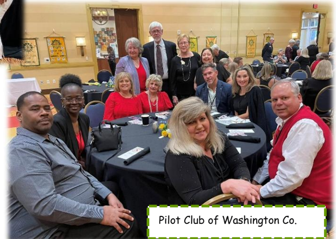
Pilot Club of Washington Co.