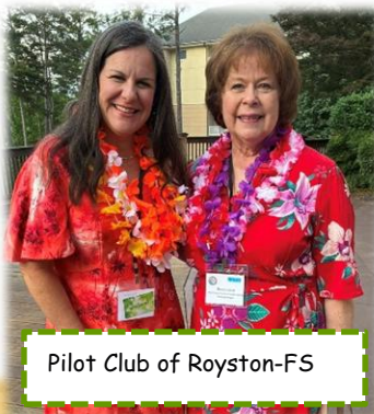
Pilot Club of Royston-FS