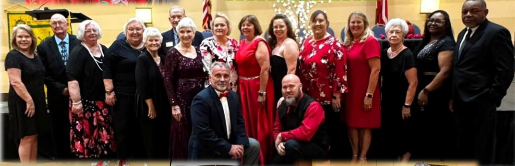
Pilot Club of Elberton