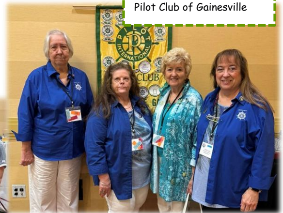
Pilot Club of Gainesville