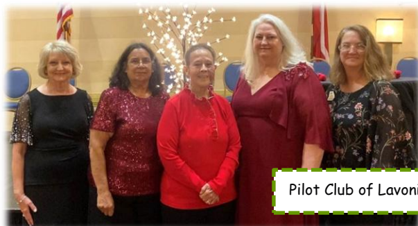
Pilot Club of Lavonia