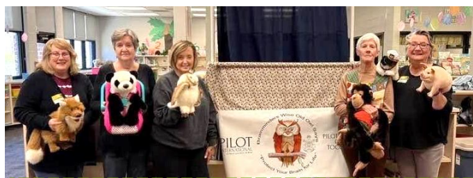
Pilot Club of Toccoa had the opportunity to share the BrainMinder Buddies with Big A Elementary School students and inform the students about brain safety. Skits were presented to 354 Pre-K and Kindergarten students on how to protect their brain as they learned to "Play Smart and Play Safe!". It was an enjoyable week!