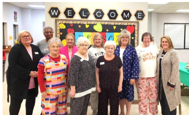
Pilot Club of Madison Co.'s meeting theme this month was pajama night!! What fun we had coming comfortable. Pilots and Anchors were such cuties!