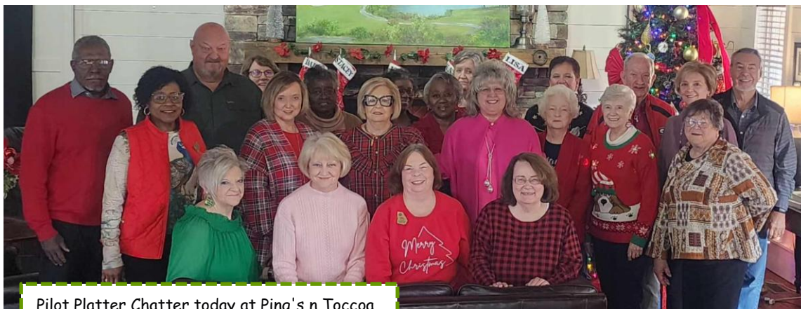
Pilot Platter Chatter today at Ping's n Toccoa