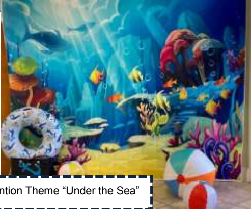
Anchor Convention Theme "Under the Sea"

ANCHOR CREED Realizing that in unity there is strength, we, as members of the Anchor Club, are resolved: To work together in friendship and loyalty; to render service to our home, school and community, knowing this course will take us over a sea of happiness; to steer our ship of life by the bright stars of Hope and Faith; to follow words of guidance from parents, teachers, and Pilot friends, for those, as gleams from the Lighthouse of Truth, are of wisdom, to set full sail through channels of achievement which lead us to the port of success; and, when our ship of life is tossed by the tempests of misunderstanding and the angry winds of injustice we will cast our Anchor of courage, wisdom, and trust to hold us fast.