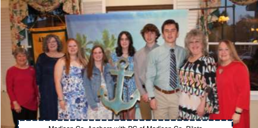
Madison Co. Anchors with PC of Madison Co, Pilots