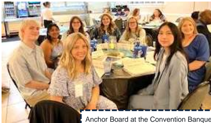
Anchor Board at the Convention Banquet