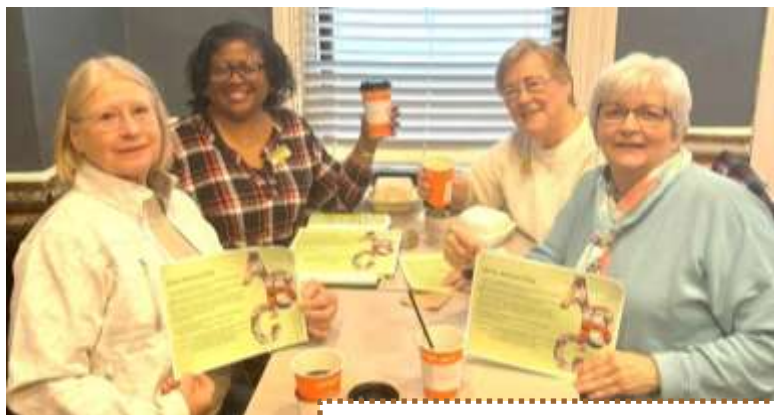
Pilot Coffee & Conversation this morning at Diesel Donuts. Washington Co. members enjoyed brainstorming Pilot Club information. Good time had by all!