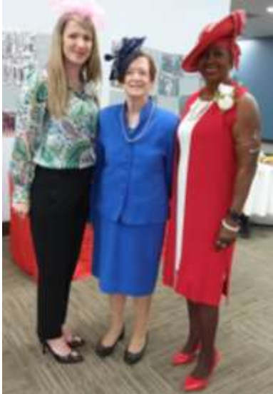
Sweetwater Pilots at their "A Church Hat Tea Party"

Pilot fundraising is the foundation of Pilot Service as it affords us resources to aid and accomplish our goals and plans of work within our Georgia District communities. Our clubs have been busy playing bingo, bunco, Chicken Salad Sack Lunches, hosting chili, chicken mull, and salad dinners, fashion shows, etc. When the true spirit of Pilot friendship and service is mixed into fundraising, our inspiration can be elevated to a greater level within our clubs, district, and international levels. Working together outside of our club meetings adds an opportunity to get to know each other a little better, learn a bit more about each other and Pilot, share a few laughs, and simply have fun! It gives us opportunity to both share and hear others' views and perspectives which is valuable for success. Be encouraged to take the time to celebrate accomplishments your members make together along the way with fundraising and discuss those elements that may not be so celebratory for all. Thinking outside of the box and trying new things can be a chore, but also may prevent us from becoming stagnant. Talk about it, try different angles on ideas, include other community entities, when possible, see what results. Communication is an awesome tool and the key of growing both personally and as a club. Communicate your fundraising thoughts, concerns, and input with your fundraising coordinator and team as this gives growth opportunity to build upon.