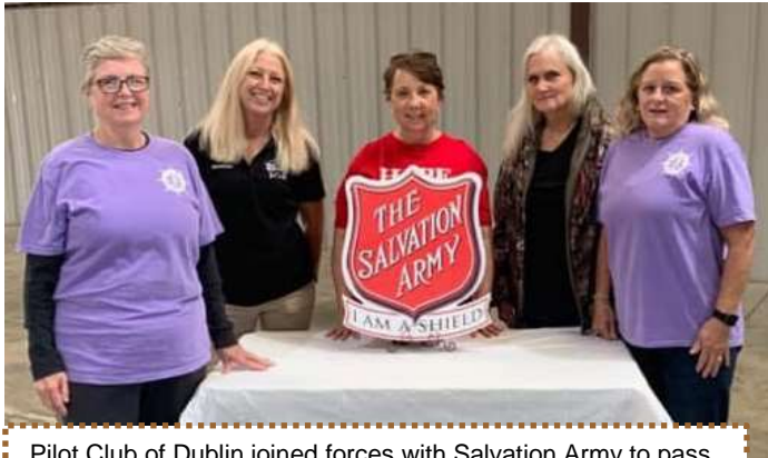
Pilot Club of Dublin joined forces with Salvation Army to pass out food to those in need