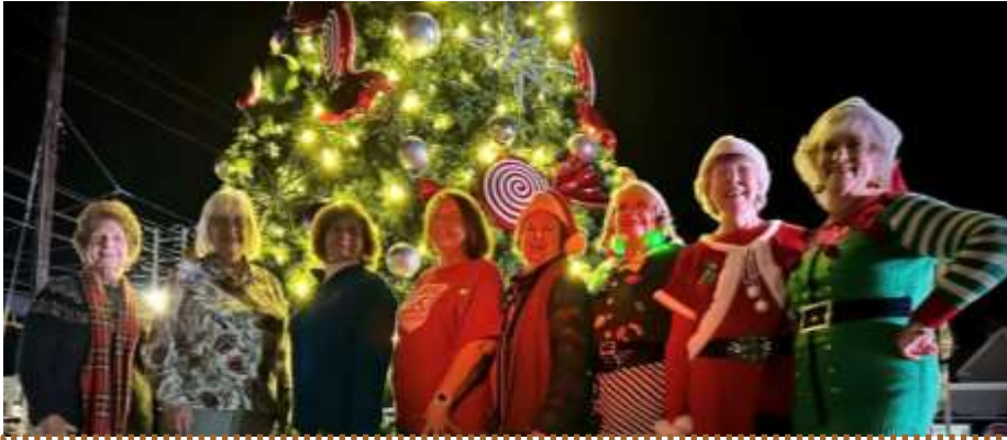
Pilot of Cochran lit Cochran's tree with many lights representing donations for scholarships going to BCHS graduates.