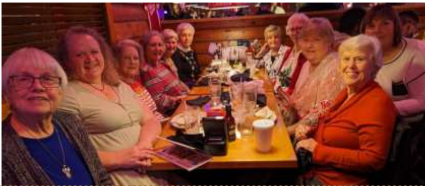
The Newnan Pilots wish everyone a very Merry Christmas 🎄 We celebrated with the fantastic and funny "3 Redneck Tenors" show at the centre, then dinner at Texas Roadhouse.