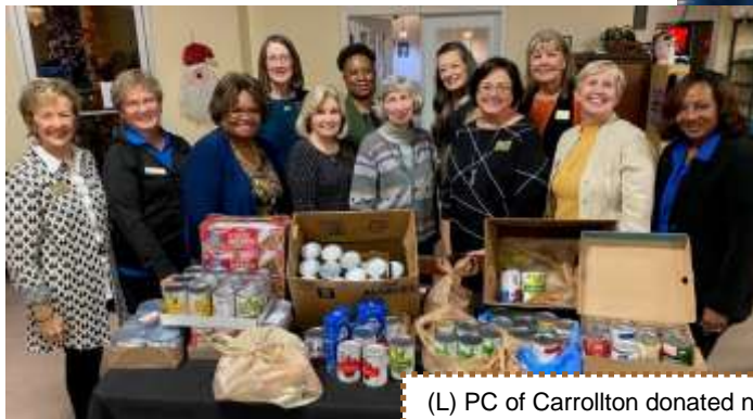
(L) PC of Carrollton donated non-perishable food items to the Carroll Co. Soup Kitchen.