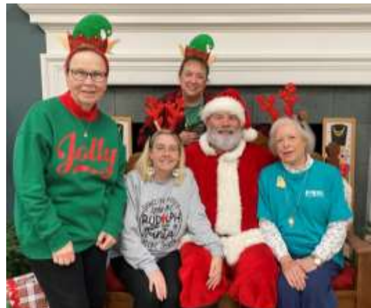
Pilot Club of Gainesville helped out with Hall is Home- Foster Kid's Celebration Party