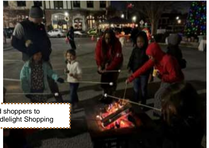
Pilot Club of Elberton treated shoppers to s'mores for shoppers at Candlelight Shopping