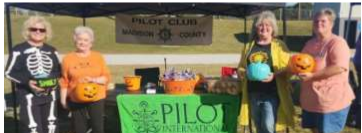
Pilot Club at Madison County gives candy, sensory toys, stickers and other treats during Halloween in the Park on Friday, October 27, 2023.