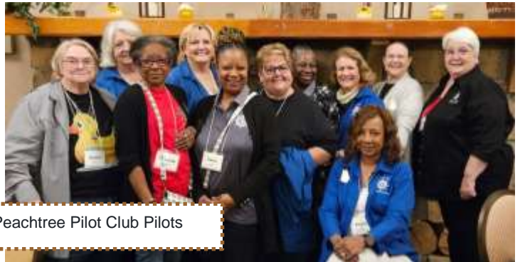
Peachtree Pilot Club Pilots