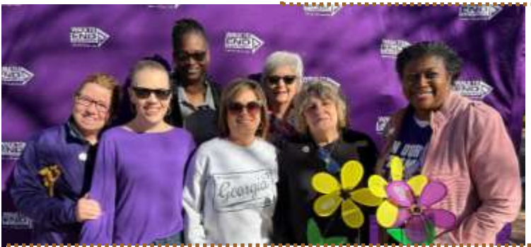
Pilot Club of Washington County members joined in support of Alzheimer Awareness Walk on Nov 4th in Sandersville, Ga.