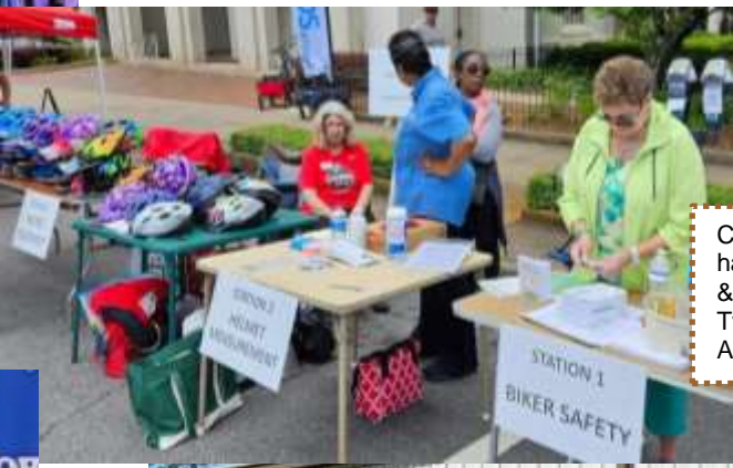
Classic City Pilot Club had a Helmet education & giveaway at the Twilight Criterium in Athens.