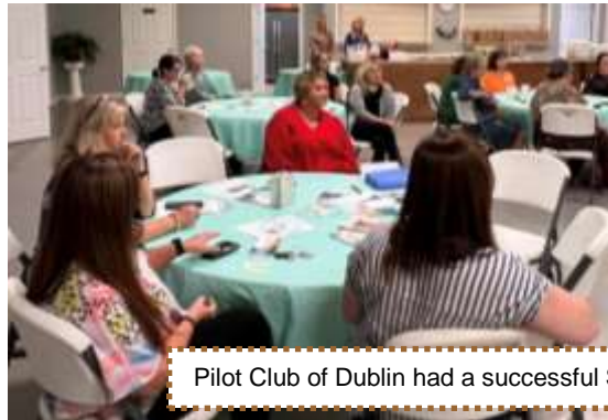
Pilot Club of Dublin had a successful Shared Pilot with 14 guests