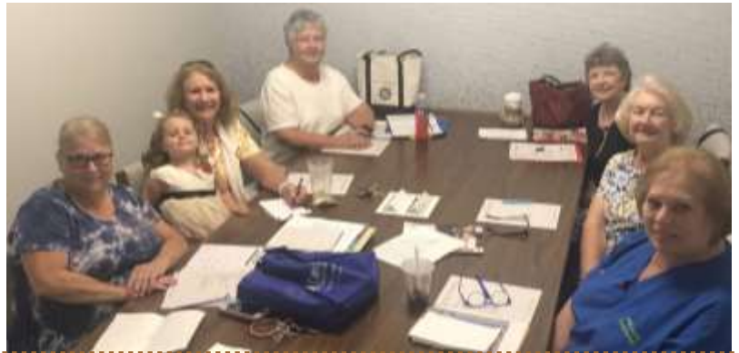
Pilot Club of Brunswick having their first Board Meeting for the new Pilot year