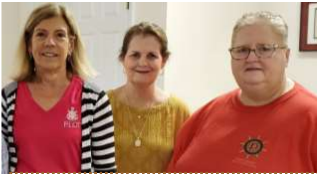
East Central Region Workshops was held Saturday May 14th