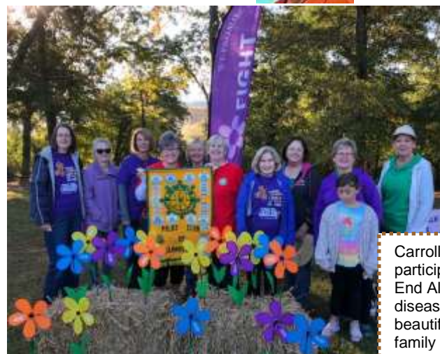
Carrollton Pilot Club of Pilot International participated in the annual West Georgia "Walk to End Alzheimer's" to promote awareness of the disease and raise funds for research. It was a beautiful fall morning for a walk with members, family and friends!