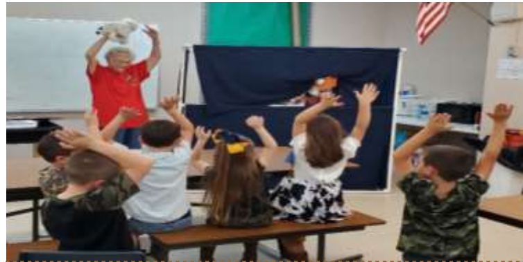
Pilot Club of Greene Co. presented BrainMinders to 25 students, grades kindergarten to 3rd grade, at Nathaniel Greene Academy on September 20th. The students seemed to enjoy it and I know we did.