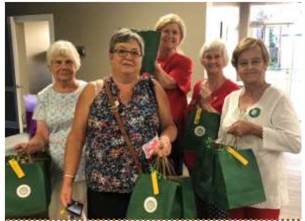
PC of Bainbridge assembled pick-me-up bags for pharmacists at several locations.