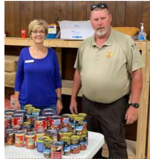
Lavonia Pilots donated needed items for our local food pantry at the October meeting. Supporting the food pantry is one project that all members hold dear to their ❤️.