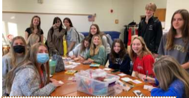
Roswell Anchors made Christmas cards to include in Holiday Goody Bags.