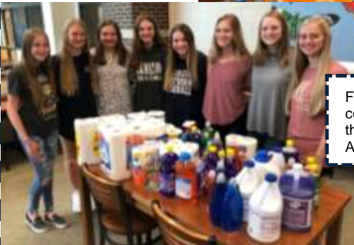
Franklin HS Anchors collected needed items for the Northeast Georgia Animal Shelter.