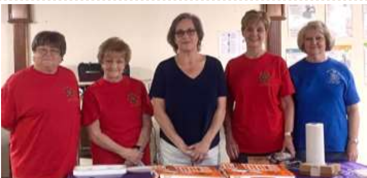
Pilot Club of Lavonia Pizza and Art Supply Party with Upstate Avita celebrating Brain Awareness week