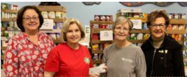
Pilot Club of Carrollton presented a monetary donation to the Carroll County Soup Kitchen, as well as volunteered, by making sandwiches, sorting canned goods and packing grocery bags with a wide assortment of different foods.