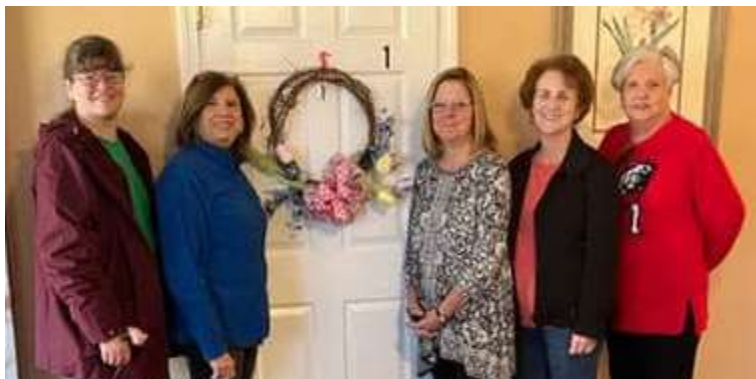
Pilot Club of Cochran Pilots delivered spring wreaths to Royal Care residents.