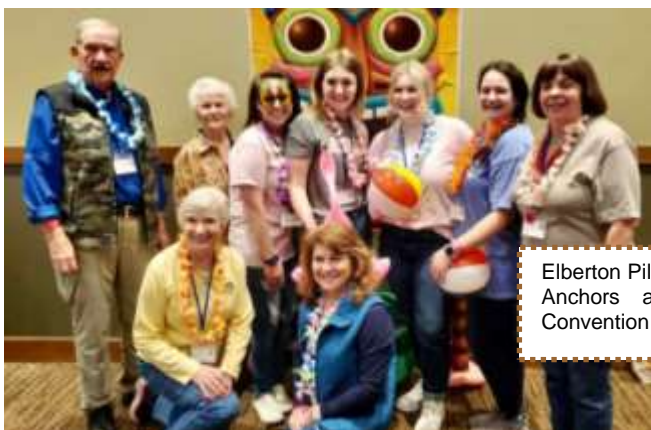
Elberton Pilots & Elbert Co. Anchors at the Anchor Convention