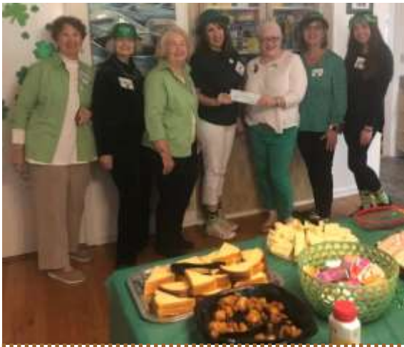
Pilot Club of Brunswick visited Memory Matters for their March social gathering. They brought lots of food & Pilot fun along with a check!