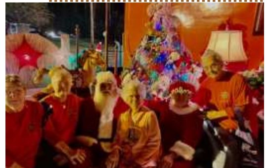
Ocilla-Irwin Pilots worked the Christmas in the Park in their community