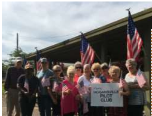
Pilot Club of Hogansville is a vital part of our community. For many years, the Pilot Club has displayed flags in the Calvin Hipp Veterans Memorial Park in downtown Hogansville. The flags are displayed on Memorial Day, 4th of July, and Veterans Day each year. This display only adds to the beauty of our downtown area. Many people enjoy seeing the flags but never see the "workers" behind the scene.