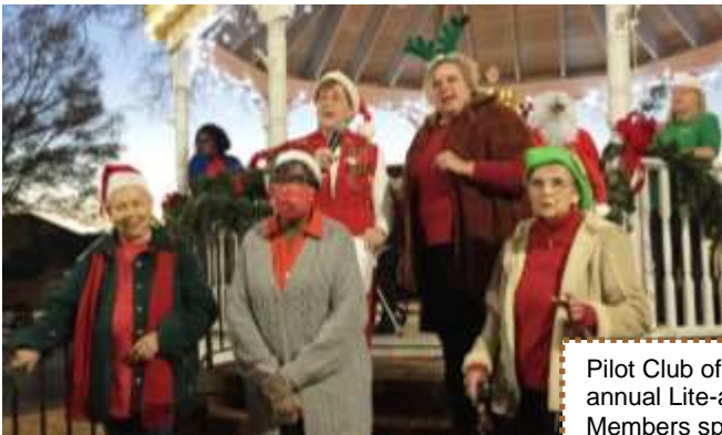
Pilot Club of Washington County at the annual Lite-a-lite fundraiser. Emeritus Members spotlighted on front row