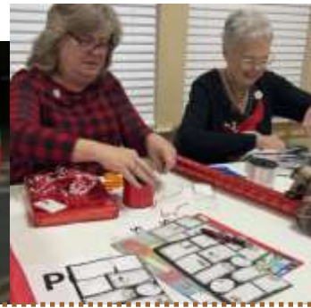
Ocilla-Irwin Pilot Club members on Christmas wrapping duty