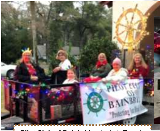
Pilot Club of Bainbridge in their Town's Christmas parade