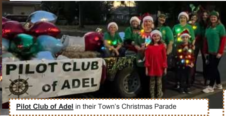
Pilot Club of Adel in their Town's Christmas Parade