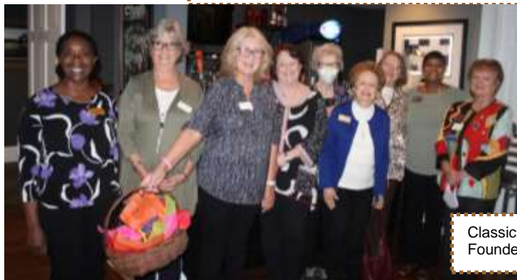
Classic City Pilots at their Founders Day event.