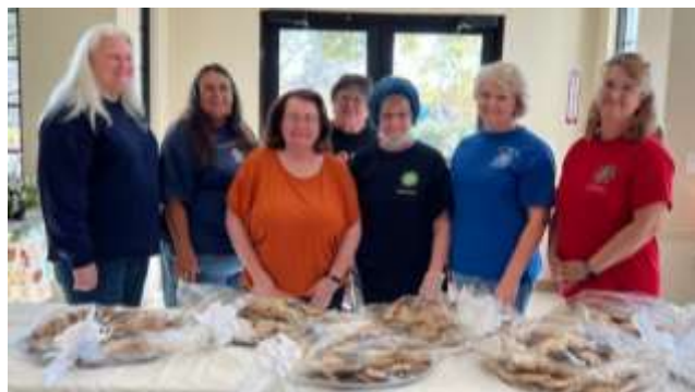
Every year, for International Care and Kindness Week, members of the Lavonia Pilot Club bake, assemble trays and deliver Sweet Treats to our area First Responders and Public Service workers. It is a small way for us to show how much we all appreciate their service and commitment to our community.