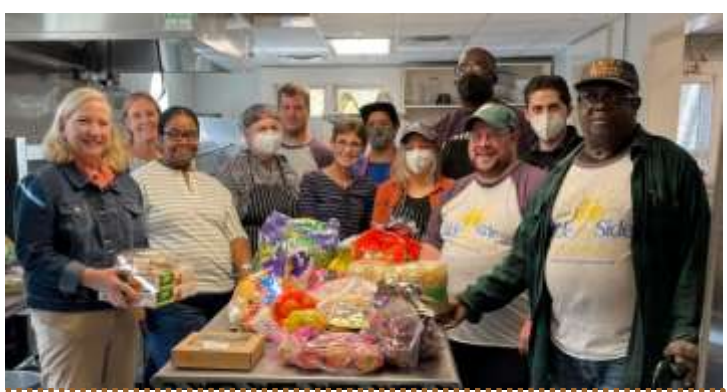
Pilot Club of Monroe provided the food for Side by Side guests to prepare their Thanksgiving meal. This project services both our mission goals - caregivers and traumatic brain injuries.