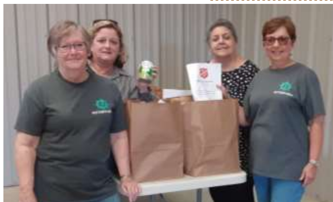
Pilot Club of Dublin had a great time helping the Salvation Army distribute Thanksgiving meals.