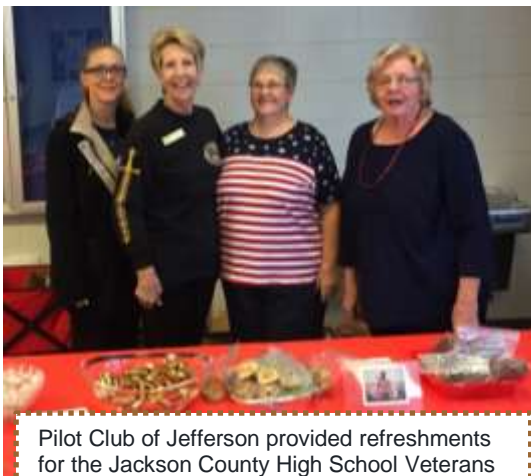
Pilot Club of Jefferson provided refreshments for the Jackson County High School Veterans Day Program..