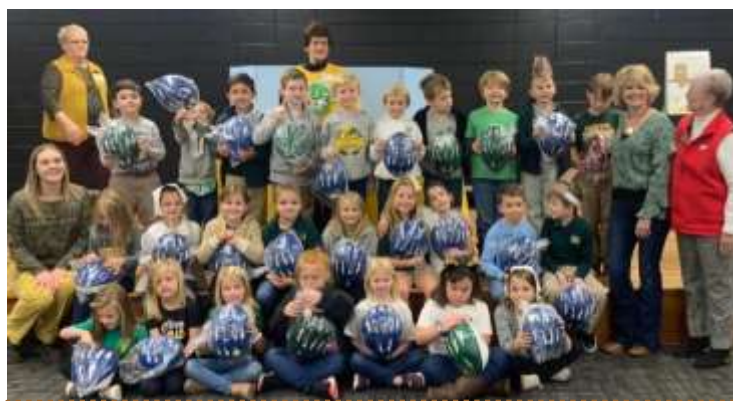
Pilot Club of Eatonton doing their BrainMinders program

THE MISSION OF PILOT INTERNATIONAL IS: Pilot International's mission is to influence positive change in communities throughout the world. To do this, we come together in friendship and service, focusing on encouraging brain safety and health and supporting those who care for others.