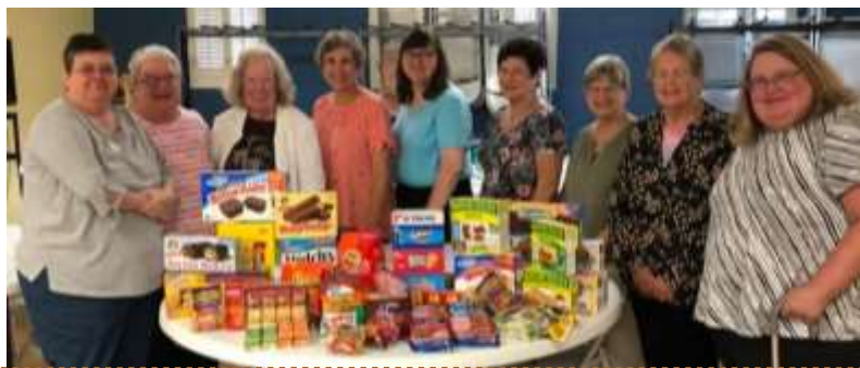
Pilot Club of Covington: Members collected snack food and delivered it to teachers and staff at Livingston Elementary School