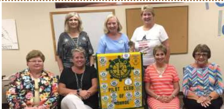
Pilot Club of Monroe: 2021-2022 Pilot Club of Monroe officers installed