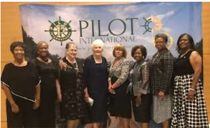
Pilot Club of Macon at Pilot International Convention