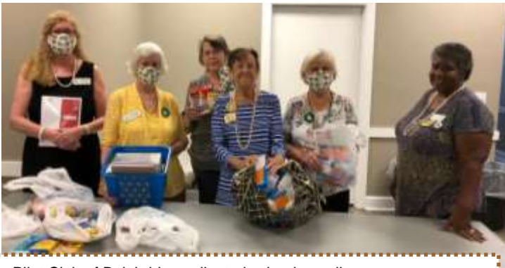
Pilot Club of Bainbridge collected school supplies.