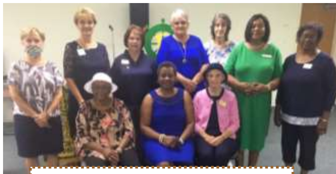
Royston-Franklin Springs Pilot Club Installation