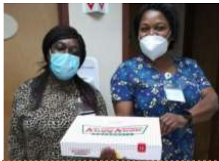
"Sweetly" Serving While Sheltering

On May 22, 2020, the Pilot Club of Atlanta via DoorDash delivered 14 dozen donut smiles to the staff at A.G. Rhodes in Atlanta. The Krispy Kreme donuts were shared with all three shifts. These essential staff members are true saints during these times when family members can't visit their loved ones. The Pilots wanted to say THANK YOU to them for being so sweet. We couldn't think of a better way to share a few smiles. While they can't be seen because of the masks; however, we are told that there were plenty of smiles (and donuts) to go around!