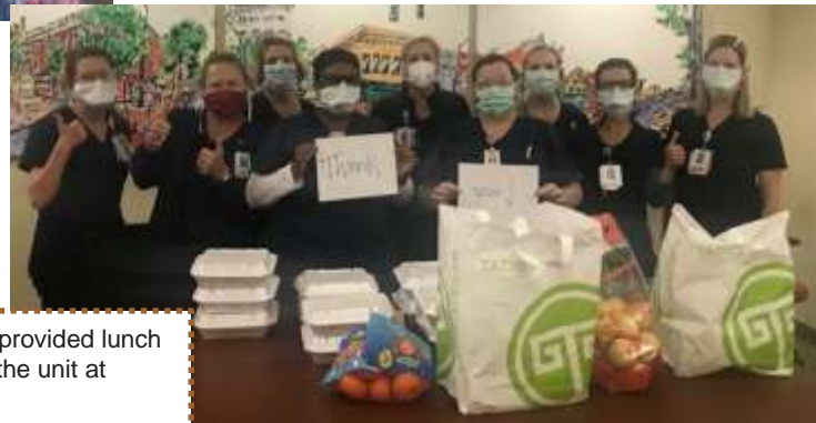
Pilot Club of Oconee Co. provided lunch many times for nurses in the unit at Piedmont Hospital.