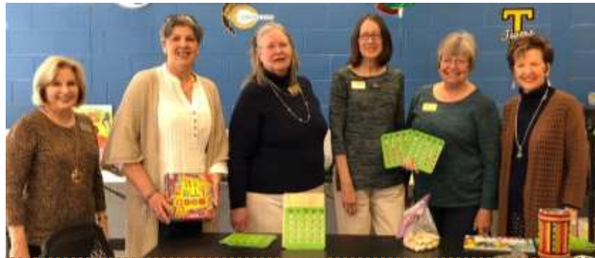
Carrollton Pilots volunteered at the Carroll County Training Center's monthly BINGO game