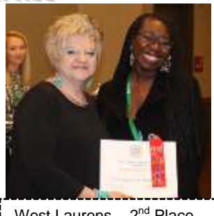
West Laurens - 2<sup>nd</sup> Place