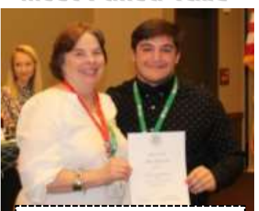
Franklin County - 3<sup>rd</sup> Place