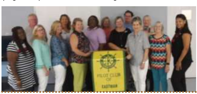
Pilot Club of Eastman held their annual prospective new member brunch and had 7 guests to attend.