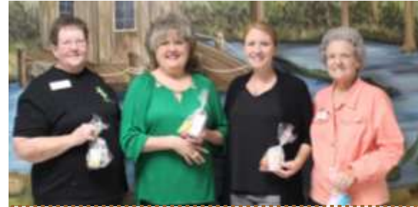
Pilot Club of Madison County delivers supplies to Special Education classes at Ila Elementary for Kindness and Caring Week as Pick Me Ups.