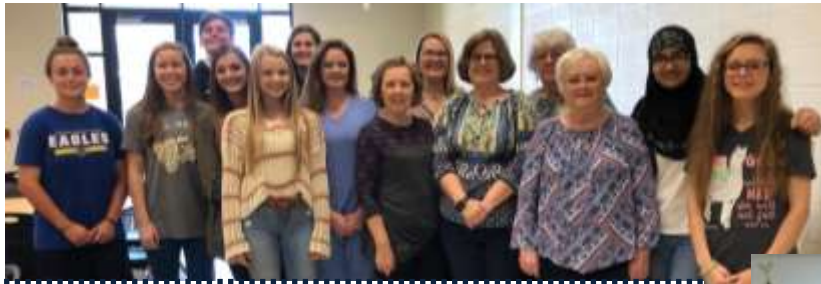
Pilot club of Adel served Breakfast to Cook HS Anchor Club during their installation of officers