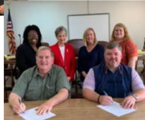
Eastman Pilots signed a proclamation for the 98th birthday of Pilot International.