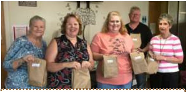
Eastman members gathered to pack goody bags for all the Dodge County bus drivers. They put a label on each bag that read..."Compliments of the Pilot Club of Eastman...Thanks for your service in our community."