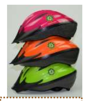
Pilot International Signature Safety Helmets