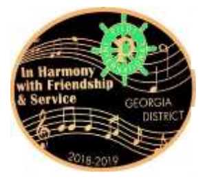
JUNE 2019 GB PAGE 4