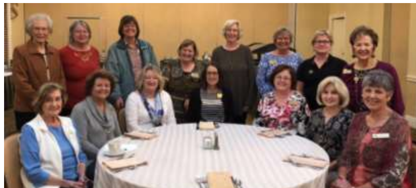
Founders Day was celebrated by the Pilot Club of Carrollton by reviewing the past, celebrating the present, and looking forward to the future. 100 YEARS in 2021!