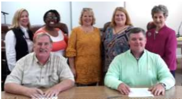
Eastman Pilots signing a proclamation for Pilot's 97th year of friendship and service.