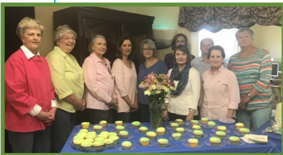
Members of the Pilot Club of Jones County at their Easter Party at Gray Rehab