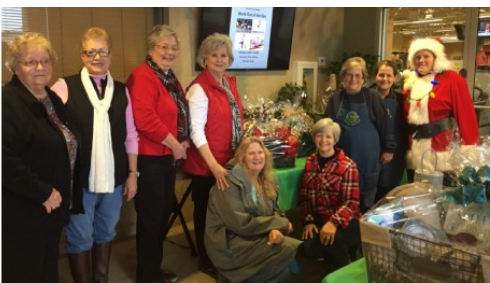
Members of the Pilot Club of Jones County at their Christmas Basket & Bake Sale