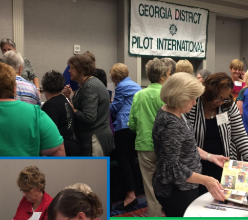
Georgia District Pilots working on "Wishing Ornaments" during a workshop at the 2017 Fall Council

Georgia District Pilots making new friends during the Pilot Scavenger Hunt at the 2017 Fall Council