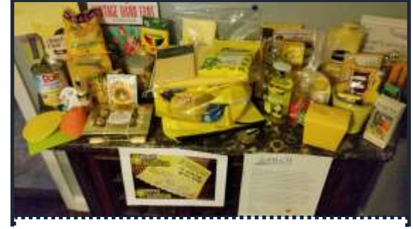
Items that Peachtree Pilot Club of Atlanta members included in their Pick Me Up Caregiver "Box of Sunshine" in January.

Our Vision: Pilot International envisions a world where all are valued.