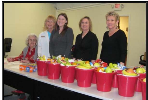
Commerce members put together gift baskets and delivered them to shut-ins in their community.

His fundraiser back in November raised over $20,000.00 for St. Jude's Children hospital and their Pilot club was a part of this effort.