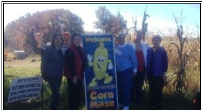
Pilots from Cochran visited the North Georgia Mountains for a November weekend retreat. Corn mazes gave our brains a challenge; and colorful leaves provided beauty for the senses. There is nothing like fresh air, travel, and friendship to bring good ideas to the surface.

The Vision of Pilot is to achieve universal awareness and prevention of brain-related disorder and disabilities.