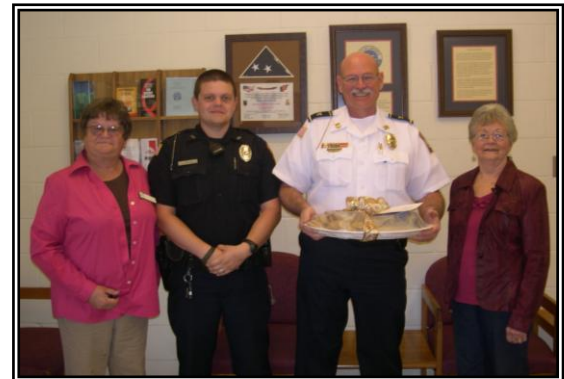
Pilot Club of Lavonia delivered homemade cookies to the fire, police and EMS stations.