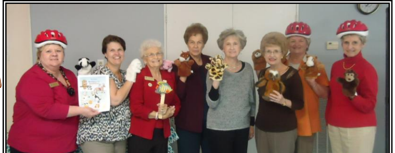
The PC of Eastman presented a BrainMinders program for their members and guests at the Nov 19th meeting. The program focused on brain safety and protecting your brain for life.