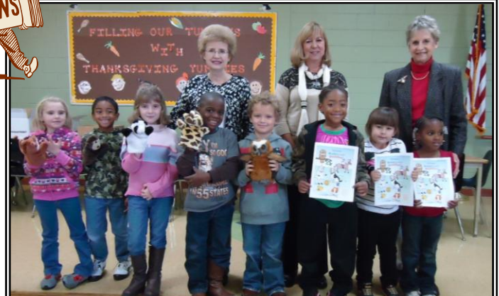
Eastman Pilots presented BrainMinders at both Elementary Schools in Eastman during November. Over 800 students and some 45 teachers and staff in grades K, 1st and 2nd were touched by these presentations which focused on brain safety.