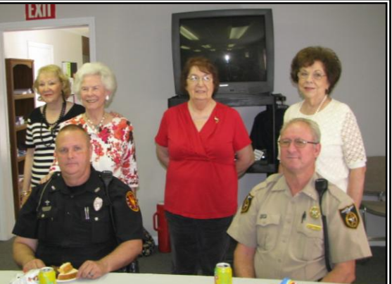
Members from the Pilot Club of Ocilla-Irwin took snacks to the Ocilla PD to honor law enforcement.

This is an excellent project for any club to say "thank-you" to our firemen and police. Great job, Ladies!